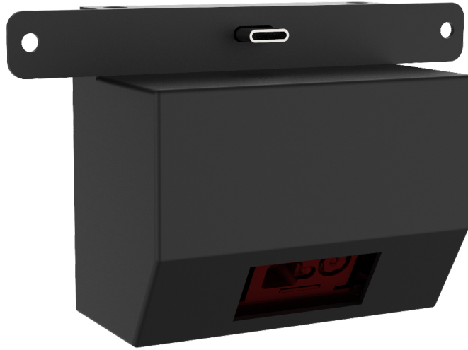
NEB1702 - 2D Barcode Scanner

The Honeywell Barcode is a 1D and 2D engine that provides flexibility to any kind of applications such as data collection and price checkers. Mostly used to open a browser upon scan or to open a page in an app. Glory Star provides a Demo APK to support your software integration to our tablets, please go to our support page to download the demo APK. The barcode is easily installed by users, providing an integrated solution and eliminating the need for external brackets or attachments.